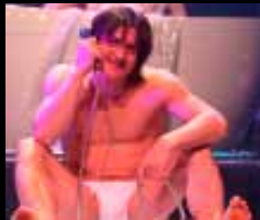
Australian Tour Cast Feb./Mar. 2015